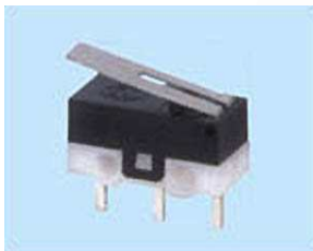
MSM-22 1 A 125/250 VAC SPDT 3P