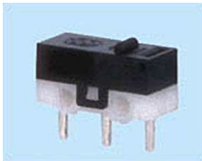
MSM-21 1 A 125/250 VAC SPDT 3P